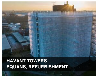
HAVANT TOWERS EQUANS, REFURBISHMENT