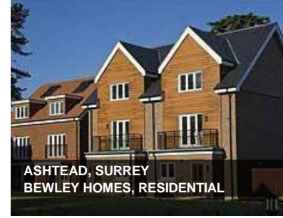
ASHTEAD, SURREY BEWLEY HOMES, RESIDENTIAL