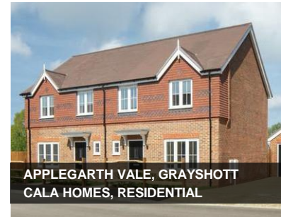
APPLEGARTH VALE, GRAYSHOTT CALA HOMES, RESIDENTIAL