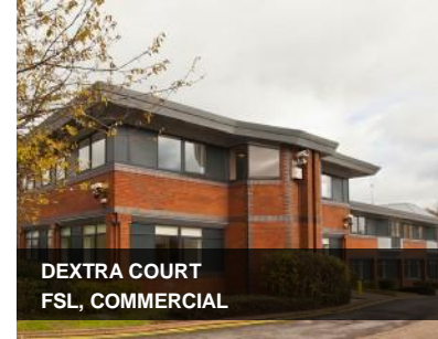
DEXTRA COURT FSL, COMMERCIAL