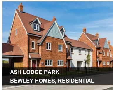
ASH LODGE PARK BEWLEY HOMES, RESIDENTIAL