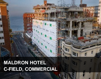
MALDRON HOTEL C-FIELD, COMMERCIAL