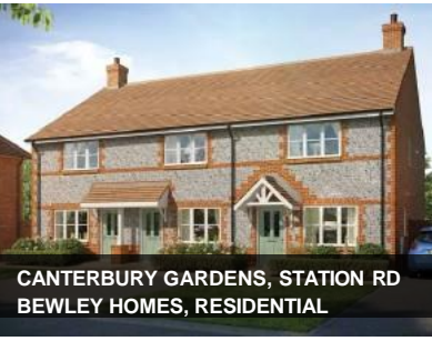
CANTERBURY GARDENS, STATION RD BEWLEY HOMES, RESIDENTIAL