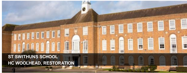
ST SWITHUNS SCHOOL HC WOOLHEAD, RESTORATION