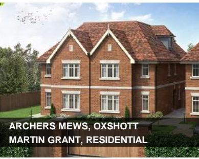
ARCHERS MEWS, OXSHOTT MARTIN GRANT, RESIDENTIAL