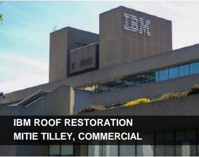
IBM ROOF RESTORATION MITIE TILLEY, COMMERCIAL