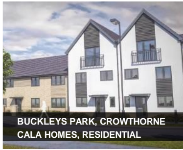
BUCKLEYS PARK, CROWTHORNE CALA HOMES, RESIDENTIAL