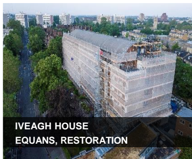
IVEAGH HOUSE EQUANS, RESTORATION