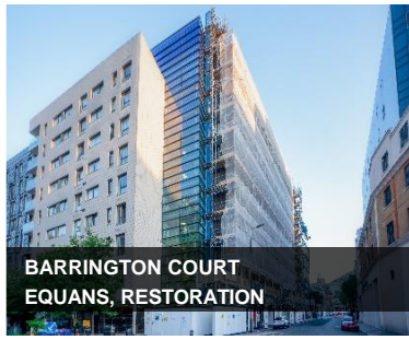
BARRINGTON COURT EQUANS, RESTORATION