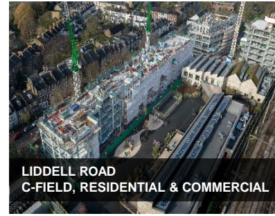
LIDDELL ROAD C-FIELD, RESIDENTIAL & COMMERCIAL