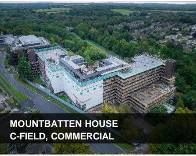
MOUNTBATTEN HOUSE C-FIELD, COMMERCIAL