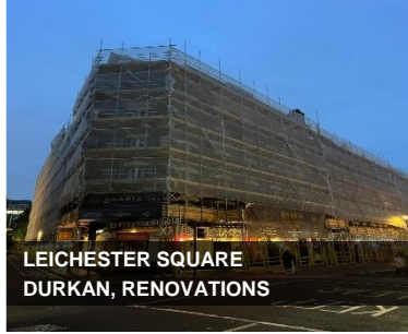
LEICESTER SQUARE DURKAN, RENOVATIONS