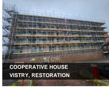
COOPERATIVE HOUSE VISTRY, RESTORATION