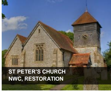
ST PETER'S CHURCH NWC, RESTORATION